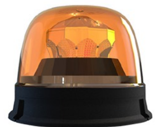
MAGNETIC BASE WITH INTEGRATED BATTERY AND REMOTE CONTROL